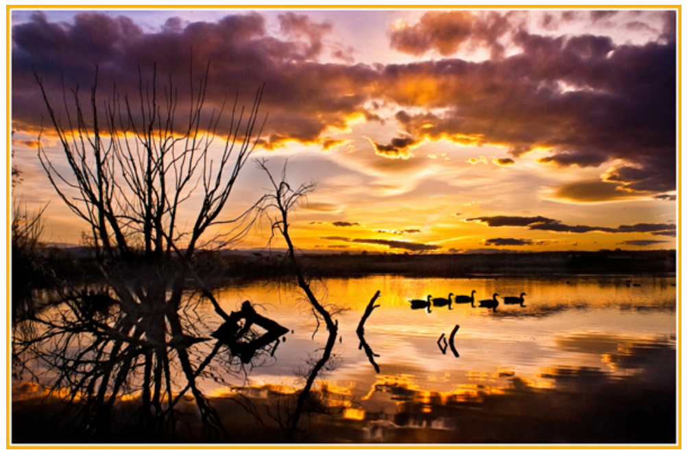
"Pond Sunset" by Tim Starr